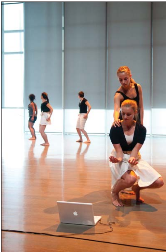
Summer Stages Dance 2010 Choreographers' Project Showcase at the Institute of Contemporary Art/Boston.