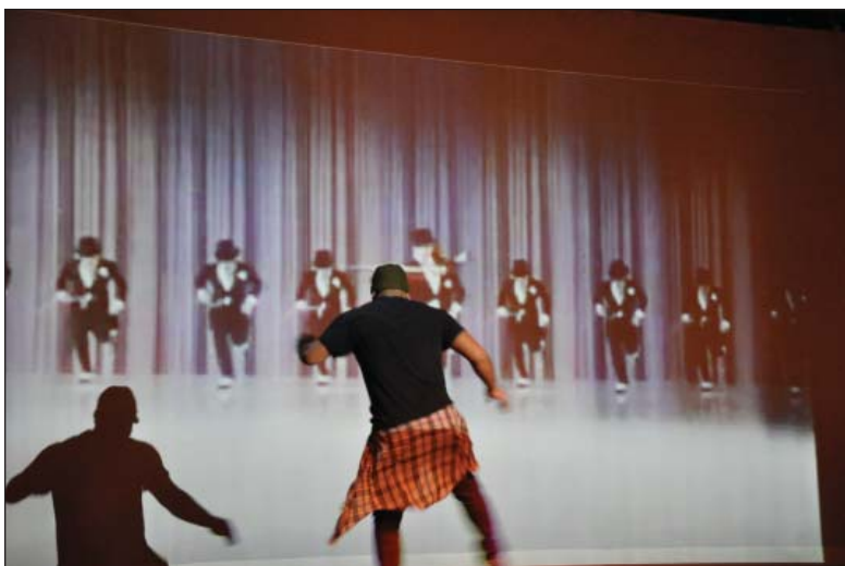
"Platypus" by Les Rivera, in-residence at Live Arts Brewery (2011).