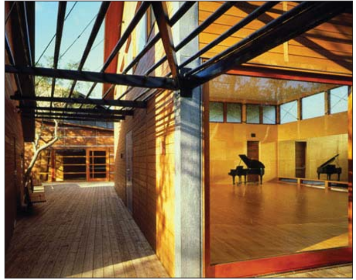
The Helene B. Roberson Dance Studio at Atlantic Center for the Arts and entrance to the Joan James Harris Theater.

Dancemakers in the mid-stage of developing new work value the opportunity to share their works-in-progress with an audience, but do not necessarily require the technical and creative resources that a dedicated production space provides. And dance residencies that do not have performance spaces can still support dancemakers' interest in connecting with the public by partnering with local facilities. For example, The Hambidge Center for Creative Arts & Sciences in Rabun Gap, Georgia, has "arranged performance space in a nearby prep school," and the Santa Fe Art Institute – located on the campus of the College of Santa Fe – has "access to the college's rehearsal and performance spaces." Frequently, however, residency programs do not publicize partnerships with local facilities, and organizations often look elsewhere for space only when the need arises and/or at the request of a dancemaker. Therefore, it is important for residency programs to communicate the full range of support they are willing to make available so that dancemakers can better make use of residencies at this stage; likewise, dancemakers should ask a residency program about the availability of nearby space before passing up an opportunity based on what facilities are on-site.