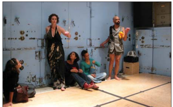
SeNSATE , a site-specific performance by Carrie Ahern Dance, with audience at Lower Manhattan Cultural Council’s Vaults at 14 Wall Street.