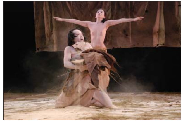
"Retrospective Project" by Eiko & Koma, in-residence at MANCC (2009).

"MANCC also offers artists-in-residence a media toolkit as they exit the residency to help with documentation and to contextualize and promote themselves, their process and – when appropriate – the work that ultimately develops from their time with us. These materials are developed with the artist and in some cases with consultation from presenting institutions, agents, managers, or other relevant distribution outlets."