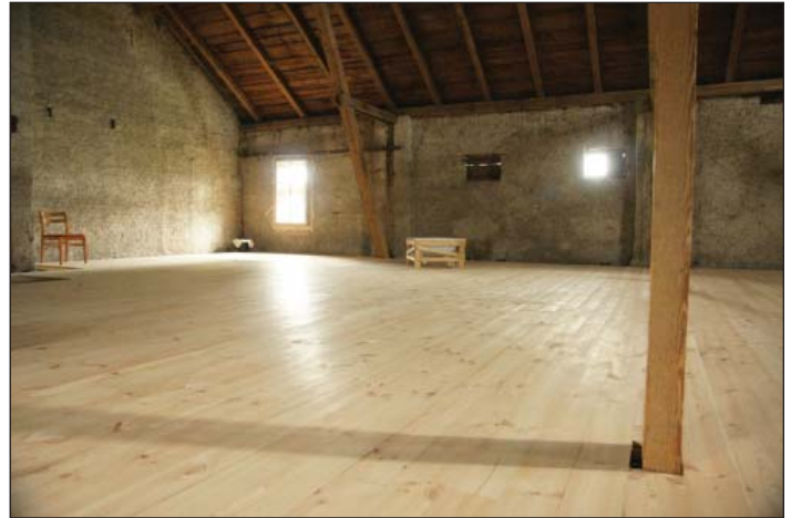
The Hayloft at Meeting in Zdonov.

It is not surprising that 80% of dancemakers surveyed respond that it is important for early-stage dance residencies to offer some form of dance-specific studio space (e.g., dance floors). Of those residency programs that offer support for dance, however, only 40% have dance studios or flooring. This translates into just 14% of the entire residency field that has facilities equipped for dance.