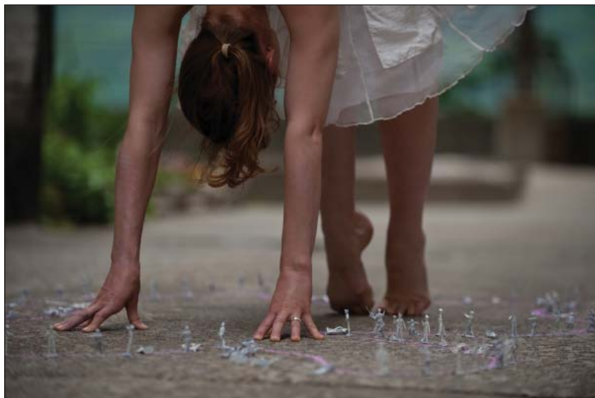
Choreographer/performer Candice Salyers during a Vermont Performance Lab residency for the development of "Significant Figures" (2010).

"Our primary focus in Vermont is on supporting artists in the research and development of new work and re-thinking how artists can engage with communities. We tailor each residency to the needs of the artists. By joining forces with other like-minded organizations that value the artist-centered approach we can collectively develop inventive models for supporting artists and our various communities."