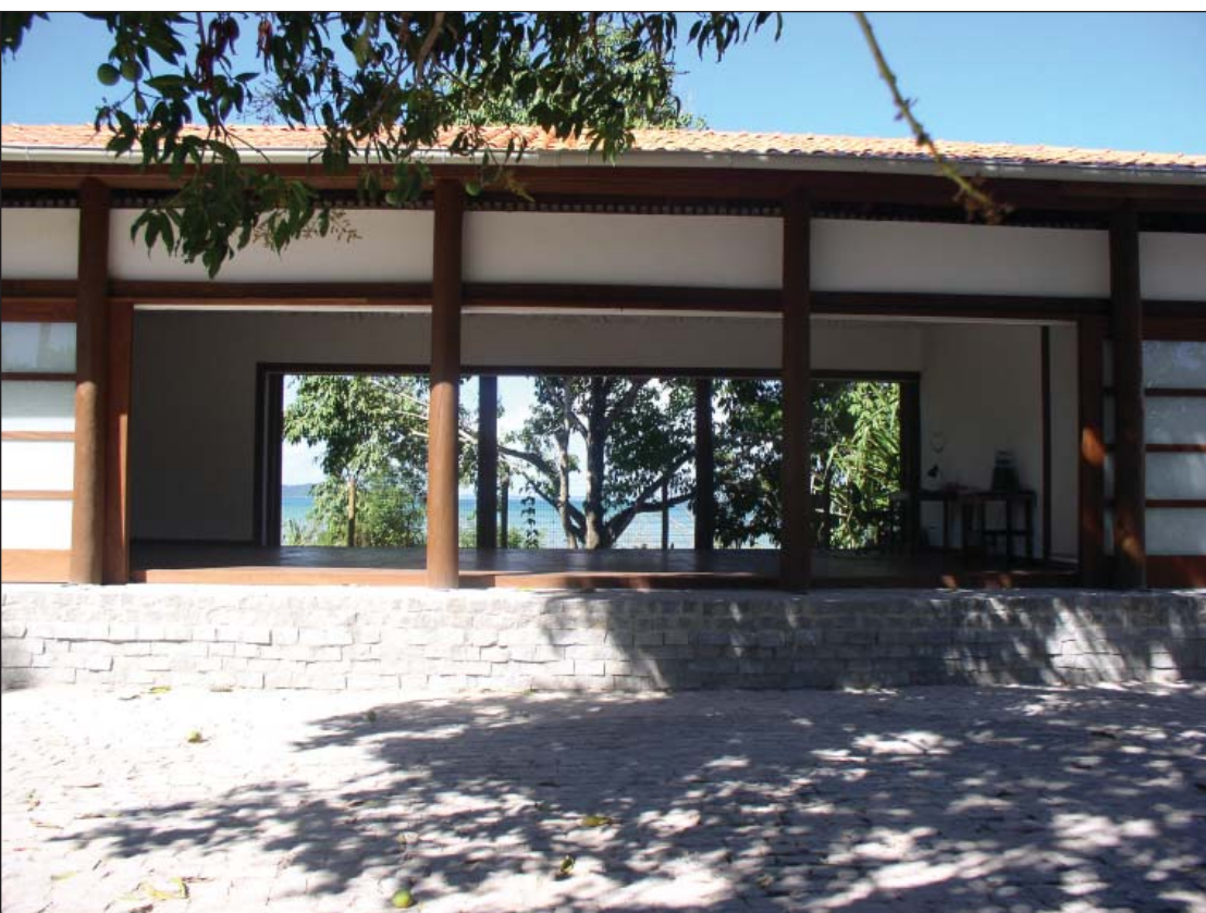
Estúdio Ar, the new dance studio at Instituto Sacatar in Itaparica, Brazil.